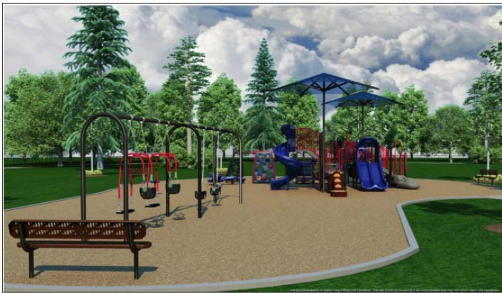
Concept for one of Riley Chambers Park’s new playground sets

BARRETT STATION, Texas – Construction is underway for playground upgrades at Riley Chambers Park. The $350,000 project will include the replacement of older playground equipment, installation of rubberized fall surfaces, and shade