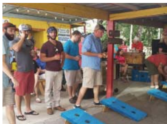
Team competition at the Rotary Washer Tournament last year.

HIGHLANDS – The Washer throwing tournament, held every year at Charlie’s Ice House, has become a city-wide must-do for many District 5890 Rotarians, as well as local folks from the greater Highlands area. Proceeds from this charity event are sent to the national Rotary program Polio Plus, which has almost eliminated this dread disease from the whole world. Highlands Rotarians are able to give one of the highest contributions, per