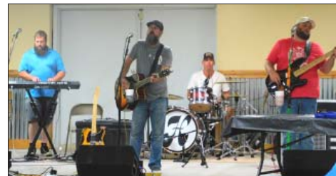
Hill Country Jane played a wide variety of songs from a variety of genres. Everyone was moving or singing along at times.

There was a festive carnival atmosphere and old friends got a chance to catch up with active deputies and retired law enforcement. The action continued from 4 until 8:00 p.m. that evening.