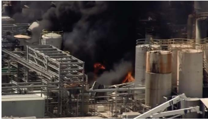
Flames and black smoke rise from the KMCO plant about noon on Tuesday.

The EPA indicates that no toxic levels of gas have been detected, yet.