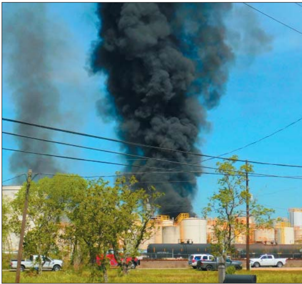
Smoke billows from the KMCO plant fire, as seen by the neighbors and first responders on Ramsey Road in Crosby.

No one would call the fire out before 5:00 p.m. although apparently considerably under more control