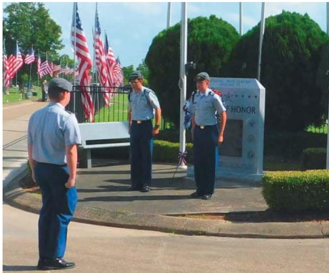
Placing the Memorial Wreath at the Garden of Honor.

How do you honor them? Firstly, never let their memories die. Secondly vow to live your life the best way that you can. Remembering that you have been given a gift. Take full advantage of the freedoms for which they sacrificed their lives. I can hear them say don't feel guilty because you survived but live they very best that you can."