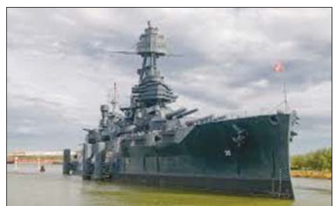
BATTLESHIP TEXAS is currently on display in La Porte, near the San Jacinto monument.