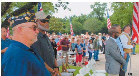
Solemn ceremony as veterans, civilians remember those that served.