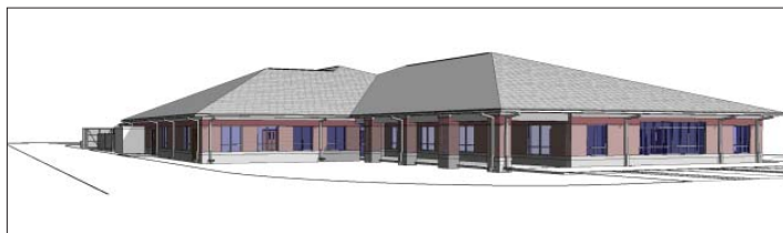
Baytown EHS-HS Rendering

Harris County Department of Education Head Start celebrated last Thursday the opening of its new 20,000-square-foot facility on about 3 acres in Baytown with a ribbon cutting. The facility will house Early Head Start and Head Start under one roof.