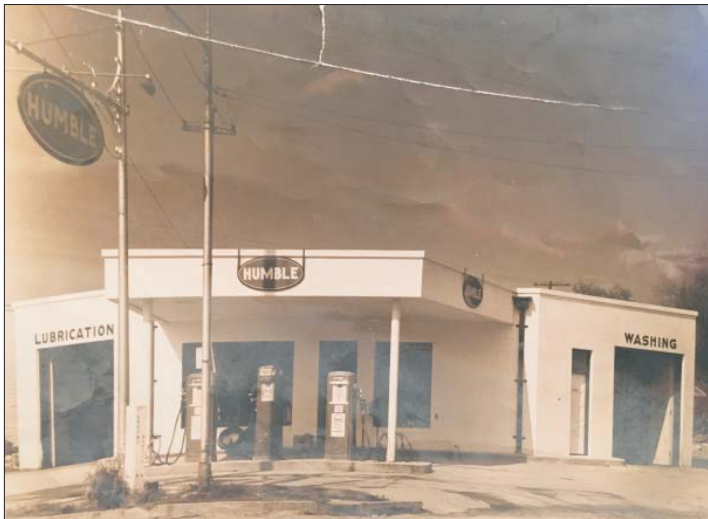
Gas station located at Kernohan and Main Street.