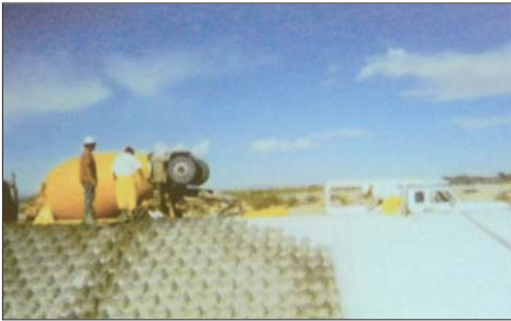
A concrete mixer at left, with forms for pouring the ACBM mat.

Part of the Phase 2 work will be to classify the type of waste in the pits. Guidelines call for it to be either hazardous or non-hazardous, and which choice will have a bearing on how it is removed, and where it can be disposed of. Jackie is concerned that tests so far have not classified the material as hazardous, but she says the tests are incomplete and not looking for dioxin and furans.