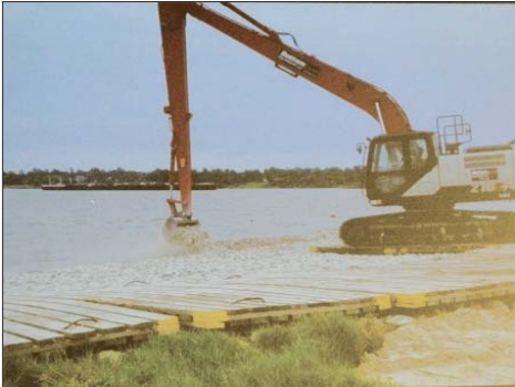
An excavator replaces some missing rock cover at the site's edge. Note the wooden roadway built to carry the heavy equipment and not disturb the existing cap structure below.

Jackie displayed a chart showing characteristics of the two classes of waste. Hazardous wastes have ignitability, reactivity, corrosivity, or toxicity.