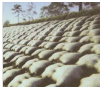
Articulated Concrete Block Mat is the current solution for sealing the toxic waste under the cap.

Construction equipment including several cranes, trucks, cement mixers, formwork and a work crew of about 15 can be seen from a safe distance, working on the placement of a new technique known as Articulated Concrete Block Mat or