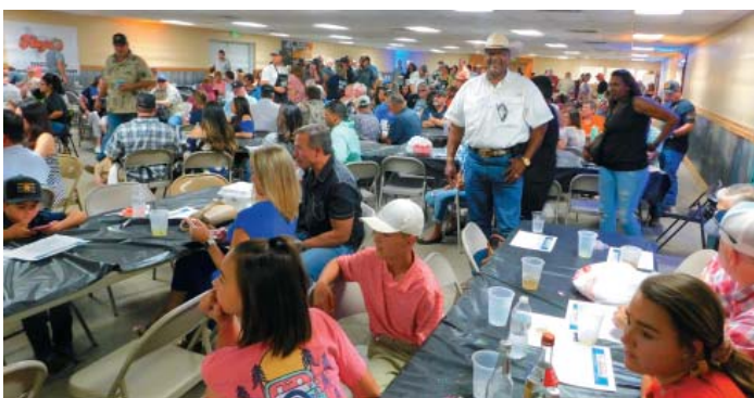
Greeting from a 1/4 room away. Eagleton smiles a welcome.

Within the Baytown Youth Fair & Rodeo Pavilion a teaming crowd ate, drank and listened to Highlands' wide ranging variety band, "Hill Country Jane." "Hill Country Jane" played late top 40, vintage country, blues and classic