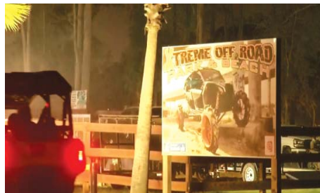
SCENE SUNDAY NIGHT AT XTREME OFF-ROAD PARK

The teenaged females flew by LifeFlight and the male went by HCESD#5 ambulance to a hospital.