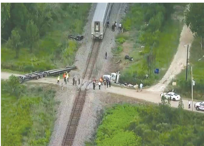
The Semi ended up in the ditch after it was hit by the AMTRAK train.

Crosby's ESD#5 took the truck driver to the hospital, Liberty County transported seven people to Dayton Regional Medical Center and 12 people