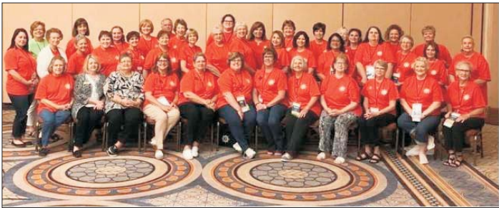
Pilot International 2019 Convention was held in Chicago. Pictured are Pilots from all over the State of Texas. Local Pilots from various clubs are included in this group photo.

Members of several local clubs - Pilot Club of Baytown, Evening Pilot Club of Baytown, West Chamber County Pilot Club, San Jacinto Pilot Club, Evening San Jacinto Pilot Club, Lake Houston Pilot Club and many others recently attended the 98th Pilot International Convention in Chicago, Illinois. More than 500 Pilots participated in the global event that drew representatives from more than three countries and geographic areas around the world.