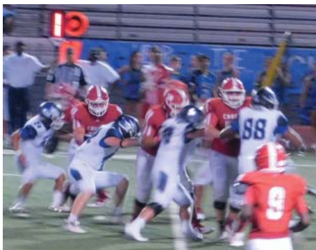
Crosby's defense enabled to stop big plays.