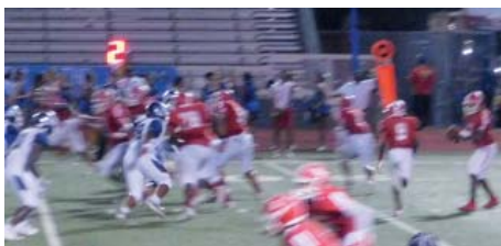
Execution developing as offensive players come to understand calls.

Crosby had a 7-3 season last year, New Caney had a 10-2. Over the last several years, 2014 until 2018, Crosby has come to expect