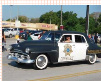
BEST CLASSIC OR ANTIQUE CAR - CONSTABLE EAGLETON'S CRUISER