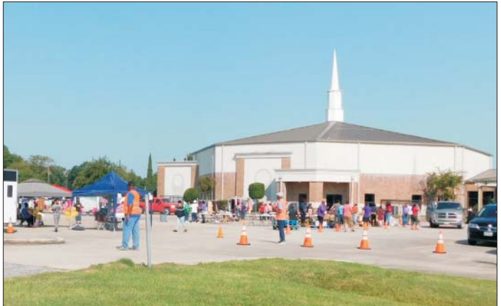
Mt. Rose Church of Christ in Barrett held their annual Bazaar last Saturday in Barrett Station. A large crowd of members and the public enjoyed the events on a sunny day.