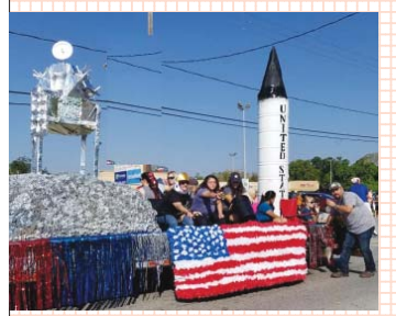
OVERALL BEST OF THEME- ZXP