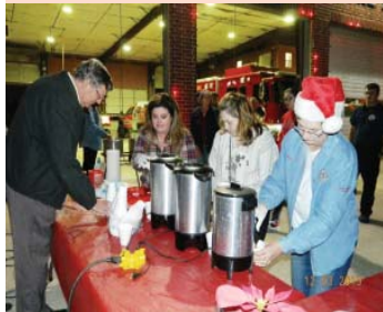
Highlands Rotarians served VERY hot chocolate all evening.