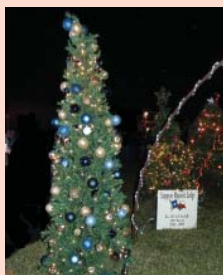
Decorated tree by Highlands Rotary.