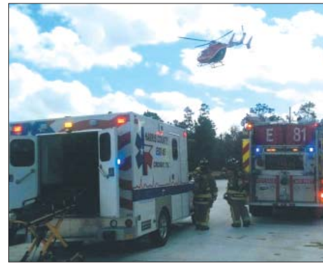
Above, rescue vehicles have completed their leg of the rescue for a woman and her daughter on November 27, 2019 as a helicopter lifts off to Hermann Hospital.

CROSBY – A man was killed, a woman and her infant were seriously injured but in stable condition when a wrong way accident occurred on a US 90 service road in the 2500 block, the same roadway as Crosby Volunteer Fire Dept. Station 1, last Wednesday. According to the Harris County Sheriff's Office that service road held a 2013 Nissan driven eastbound by a man whose identity has yet to be released and a woman in a black Chevy Equinox driving westbound. Investigators determined that the man in the Nissan crossed over into the path of the westbound Chevrolet. The impact occurred Nissan front left to Chevrolet left front, both vehicles came to rest within the roadway. The sole occupant of the Nissan, a man, showed no signs of life at the scene. The driver and an infant girl in