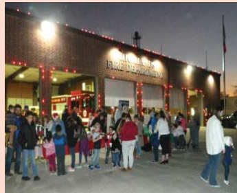
Crowds lined up for cookies and hot chocolate in front of the Highlands Fire Station.