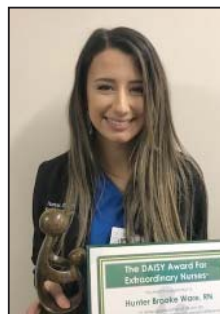
Daisy Award Ware