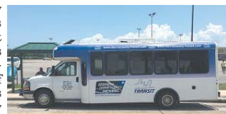
See MAP of Bus Routes, page 8

The new service will add roughly 65 additional route miles to the infra-