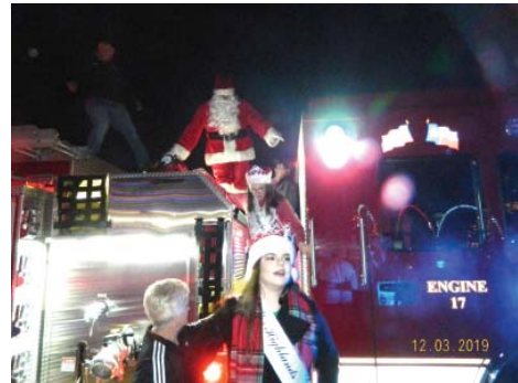
Santa's arrival on a Highlands Fire Truck was as exciting to some of the children as his actual presence.