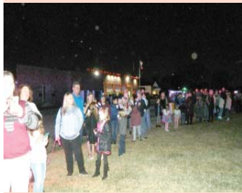
Families lined up to have their children talk with Santa. Long lines lasted for hours.