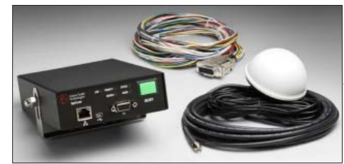
Radio units to communicate with Opticom inside emergency responders vehicles.

"If the vehicle is approaching the intersection in a predefined approach corridor and requesting priority, the equipment provides an output to the traffic controller's preempt-