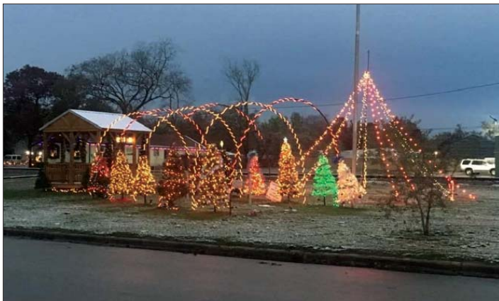
Christmas lights in Heritage Park in Highlands. About a dozen organizations decorated trees in celebration of the holiday, and in competition to see which tree Santa would pick as the best decorated. The Gazebo and a ceremonial arch were also lit, by elves from the Chamber and Highlands Horizons.