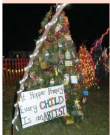
Decorated tree by Hopper Primary school.