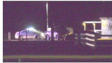
Deputies investigating shooting at The Barn at Four Pines wedding venue in Crosby.

CROSBY, Texas – A man was shot at a Crosby wedding venue during the first hours of last Monday, according to Sheriff's Office. Precinct 3 Constable and Harris County Sheriff's Deputies responded to the 21100 block of FM 2100, between Crosby and Huffman around 1:20 a.m. last Monday, Dec. 2. According to investigators, the man attended an event earlier in the day at The Barn at Four Pines Ranch venue. He fell asleep in the restroom located outside the building. When he woke up, he tried to get back in and got into an altercation with the owner. The owner then called the property caretaker and the