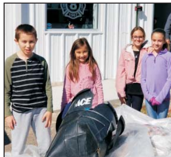
Kids also volunteered during the "Treat Beach City like someone you love" campaign.