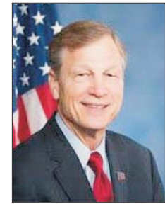
Congressman Brian Babin

"Our country's economy and employment numbers are better than they've ever been, our military has been rebuilt after eight years of neglect by Obama, and Texas is leading the way among all its peers.