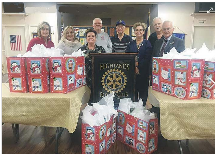
Highlands Rotarians were busy this week, preparing a number of gift wrapped bags with toys and clothing items for the needy children of a Highlands family. The Gift bags will be distributed in the Holiday spirit at the beginning of December.