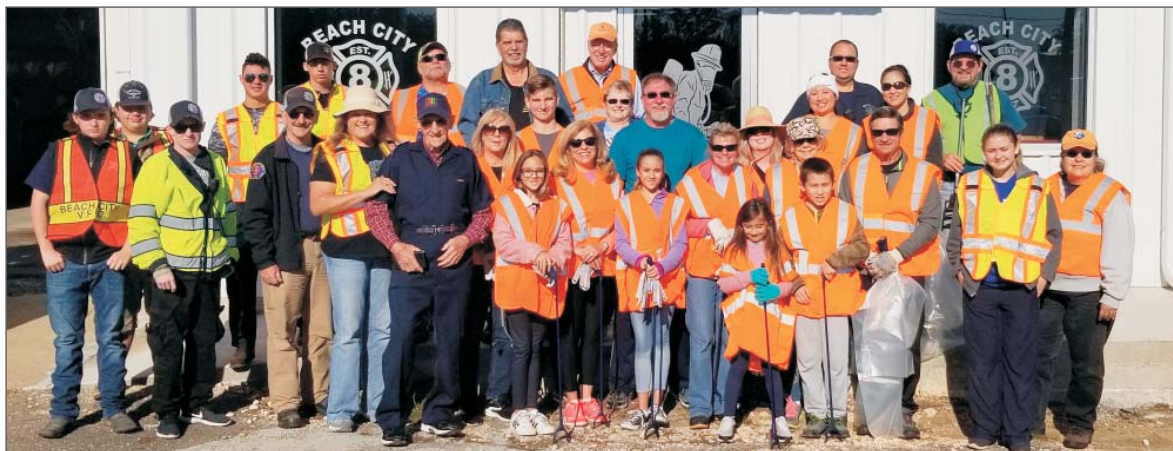
Beach City Civic Club Adopt-A-Highway volunteers

"Treat Beach City like someone you love"