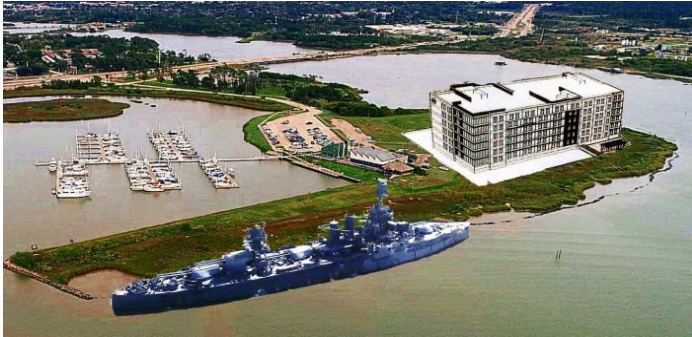
CONCEPTUAL SKETCH shows Battleship Texas and a new hotel/convention center located next to the existing Bayland Marina and O'Neal's restaurant.

The RFP is due to be returned by March 13, and at that time proposals will be evaluated and a decision made as to a home port for the ship. At the current time, it is thought that Baytown, Kemah, and Corpus Christi are the interested parties. At one time Galveston was interested, but recent statements indicate they are involved in other projects