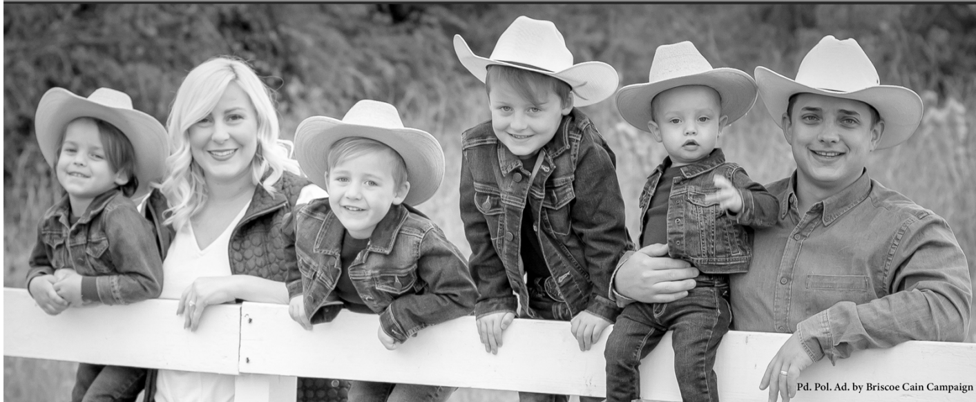
Pd. Pol. Ad. by Briscoe Cain Campaign

*As determined by the nonpartisan scientific voting record study by Rice University