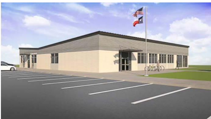
Rendering of building.

The library will be 6,000 sq. ft. and include a meeting room, children's story-time room, offer more public computers, and include additional parking and outside seating. New programs and services will also be in the works including HSE (formerly GED)