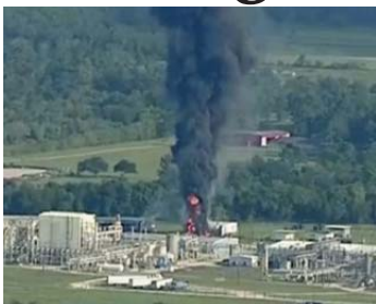
The flames that evacuated over 200 neighbors after they had flooded.