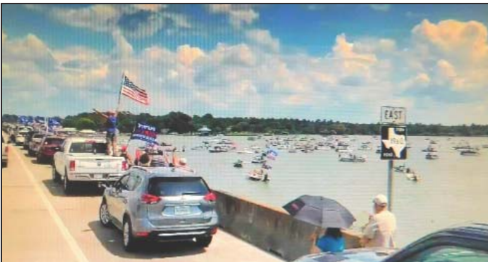
Out of Atascocita, eastbound the south end of the McKay Bridge is lined with cars, rescue vehicles, and cheering President Donald R. Trump supporters. Boats and ehicles were on both sides of the bridge and in the lake.

That was a follow up from the Lake Houston Fun Run where participants donated $10 to benefit Texas Adaptive Aquatics. Awards were