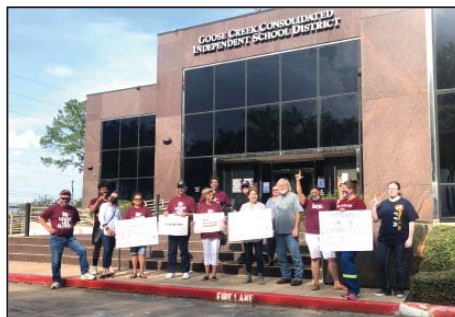
A Protest demonstration before the Sept. 9th Goose Creek board meeting, at the admin building.