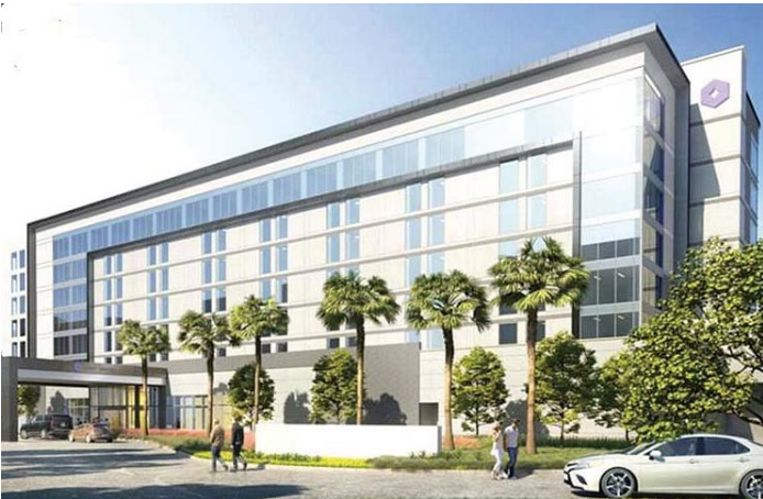
Conceptual Design Drawing of new Hyatt Regency Baytown-Houston Hotel.

BAYTOWN – City officials heard details this month about plans to secure a top name national brand hotel for the Bayland Island project, which is to include a convention center and hotel.