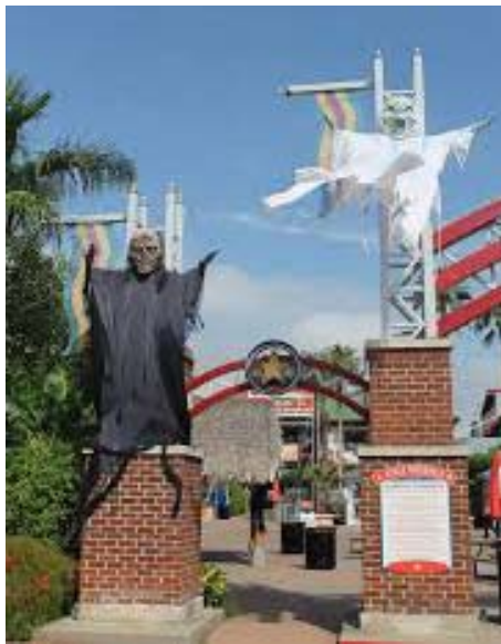
Ghouls, Goblins and Ghosts as you enter the Kemah Boardwalk.

Each weekend from 2 - 8 p.m., little ghouls and goblins can trick-or-treat on the Retail Level and experience themed craft