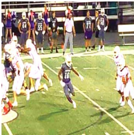
Crosby used the backfield effectively to harry the Dayton defense and the Cougar defense was relentless against pass and rush.