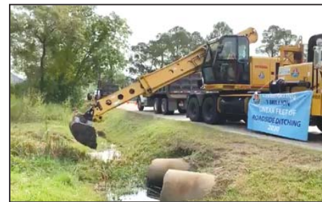
A Precinct 2 Gradall machine is the tool that is used to remove debris blocking the ditches and keeping them from draining. Blocked ditches are a major factor in causing flooding in Precinct 2 neighborhoods.