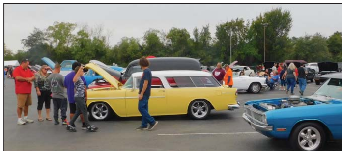
Viewers huddled around interesting vehicles last Sunday.