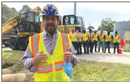
Harris County Precinct 2 Commissioner Adrian Garcia explains that cleaning ditches prevents future flooding, and is his priority. He credits the public works crews in the background for their hard work, even through the Pandemic.

years now have clean, excavated ditches. Commissioner Garcia stated "I am so proud of the Precinct 2 family for this outstanding achievement. When I tasked our team to clear 1 million linear feet of ditches, I frankly thought it might be out of reach. Not only have we gotten to a million feet, we did it 2 months ahead of schedule! What we've accomplished in one year is collectively more than had been done in the previous two years combined. The hard work of my office will make a huge difference to reduce the risk of Precinct 2 neighborhoods flooding." As a comparison, in 2017 Precinct 2 completed just over 200,000 linear feet of drainage maintenance. See Pct. 2 ditches , p. 5