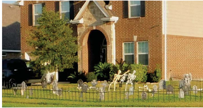
HALLOWEEN SKELETONS AND GRAVEYARD TOMBSTONES ARE THE SEASON'S DECORATIONS IN MONT BELVIEU'S CYPRESS POINT NEIGHBORHOOD.