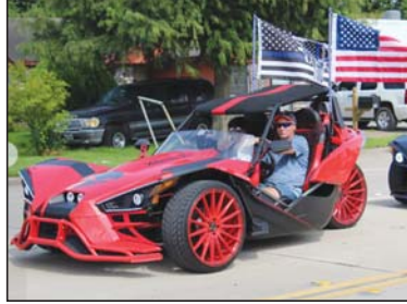
Custom Red Roadster drew lots of attention