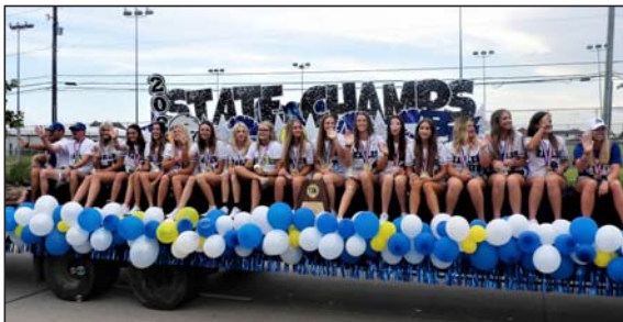
The Lady Eagles wave to fans as they make their way along the parade route.