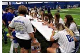
The Lady Eagles were all smiles as they chat with fans while signing softballs, ballcaps and t-shirts at a Meet & Greet.

high school softball rankings after defeating Aledo 4-1 on June 5. This is the first time a Texas team had topped the ranking.