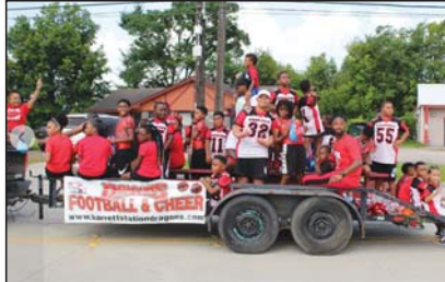
Barrett Station Dragons had lots of spirit