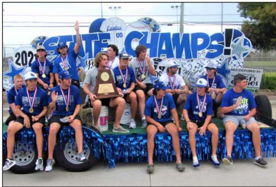
Fans cheered as the Eagles ride a float from the Barbers Hill ISD Administration Building to the high school.

Softball The Lady Eagles earned the top spot in the MaxPreps Top 25