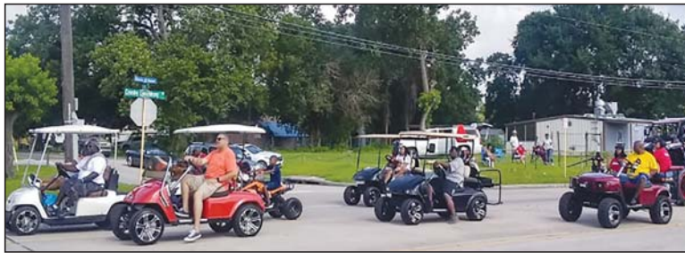
Dozens of Four-wheelers and Golf Carts made a great show down Main Street to the park.

MORE Photos on Page 1.