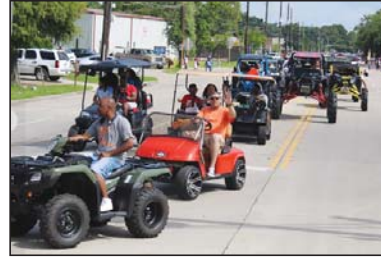
A Parade of 4 Wheelers and Golf Carts