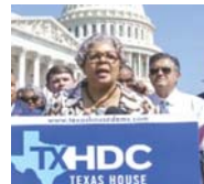
Democratic State Rep. Senfronia Thompson

three members of the caucus had tested positive for