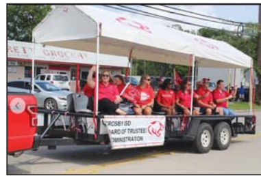
CISD Board of Trustees travel in style

MORE Photos on Page 2.