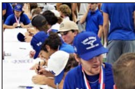
Eagle baseball team sign autographs and take pictures with fans at a Meet & Greet following the Parade of Champions.