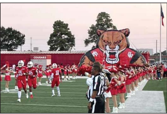
New Cougar Inflatable provided by the Crosby Education Foundation donors, used for the first time at last week's football game played at home. Not only the varsity team entered the field through the inflatable Cougar, but also "Bleacher creatures" small children arrived with the approval and joy of the crowd.