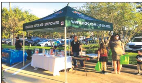
Precinct 2 and others had tents with information, gifts and handouts for the public at the Crosby Comm. Ctr.