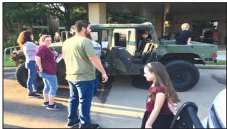
Display of a Humvee for rough or wet rescue work.