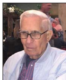
tractors, homemade ice cream, and talking about his grandkids.