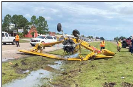
Authorities examine the wreckage of the small plane, lying in a ditch along Highway 124 in Winnie.

Earlier Saturday morning, the plane was used as a float in the Rice Festival Parade, according to the Chambers County Sheriff's Office. Once the parade ended, the pilot opted to fly the plane back to the air-