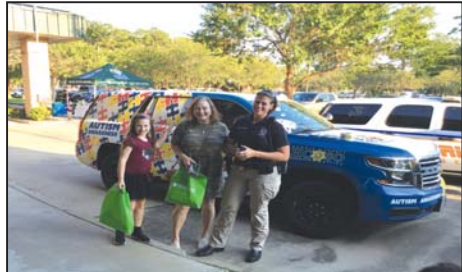
HCSO Deputy from the special Autism response unit.