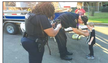
This young lad was pinned as an honorary Deputy Sheriff.