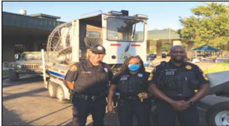
Deputies at the Crosby Community Center displayed their airboat, humvee, and other equipment.