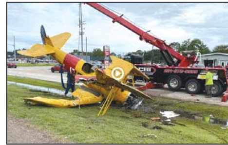
A Heavy Crane prepares to load the plane on a flatbed trailer for removal. The traffic signal that was struck is in the background to the left.

highway, the plane struck a traffic signal and wire over Highway 124 and landed upside down in a ditch adjacent to the roadway. There were no other