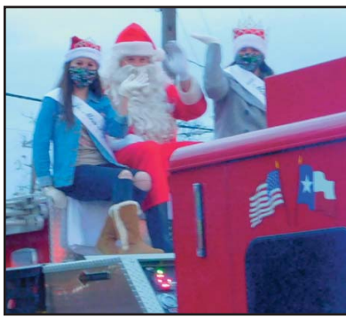
Santa with Miss Highlands at the Memorial Park in Highlands last year.

The season begins at Crosby Church, with a Christmas Festival sponsored by the Crosby-Huffman Chamber of Commerce. It will be held from 1:00pm to 5:00pm at 5725 Hwy 90 in Crosby. Planned events include a Christmas Market, Entertainment, an appearance