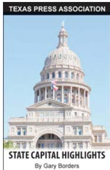
STATE CAPITAL HIGHLIGHTS By Gary Borders

The damage caused by Winter Storm Uri to the state's trees is still being assessed. While many hard-