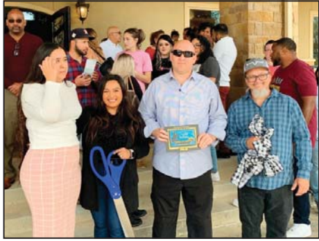
The Hundred Oaks Event Center held a ribbon cutting and Grand Opening last Tuesday, Nov. 30 at their facility in Crosby. Hundreds toured the building, the adjacent chapel, and the 100 acre site with woods and reflecting pond. Above, the proud new management at the ceremony.