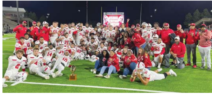
ABOVE: The Crosby Cougars team players, coaches and staff pose after the game victory in Cy Fair stadium.

In the next playoff game Friday night, the Cougs will face a team that they beat last year in the Region III area round playoffs. The Crosby community looks forward to a repeat of that victory and advancing to the Semifinals.