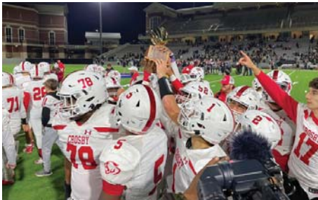
After their victory over A&M Consolidated, the team holds up the winning Quarterfinals match, in UIL 5A-D2 Region III matchup. Next the team goes plays the Semifinals against the Texarkana Texas Tigers.

The Cougars, with a record now of 11-2 overall, and 7-0 in District play, will move on to the Quarterfinals this Friday, and play Texarkana's Texas Tigers at 7:30pm at Abe Martin Stadium in Lufkin. The Texas record is 12-0 overall, and 7-0 in District