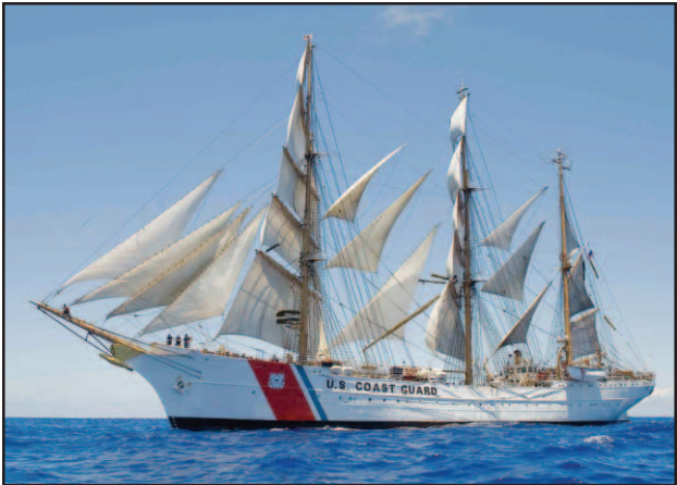
USCGC USS EAGLE under full sail. The Ship is now paying a visit to Galveston Harbor.

The Coast Guard Cutter USS EAGLE is now in Galveston Harbor, paying a public relations visit to the historic town for the first time in 50 years. It is one of only two American square-rigged sailing vessels in the U.S. Public tours were available last weekend, but long lines meant many folks simply looked on from a distance, and I might add, with awe. The 295 foot cutter, with its 3 masts and sleek lines, is a sight to see. And that brings me to my personal story about the first time I saw the ship.