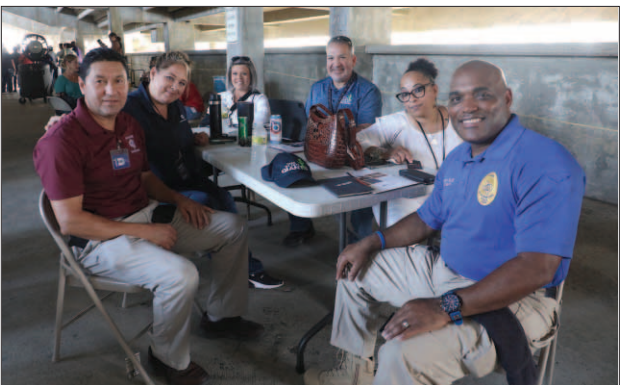
GCCISD employees prepare for the second day of the reunification training.