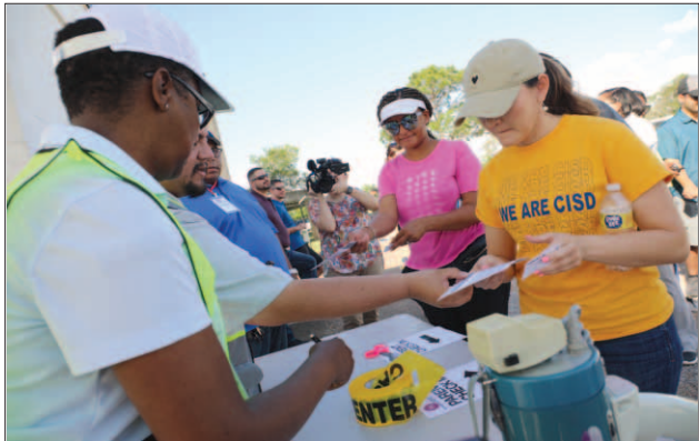
Attendees participated in a reunification exercise at Stallworth Stadium during the second day of the training.