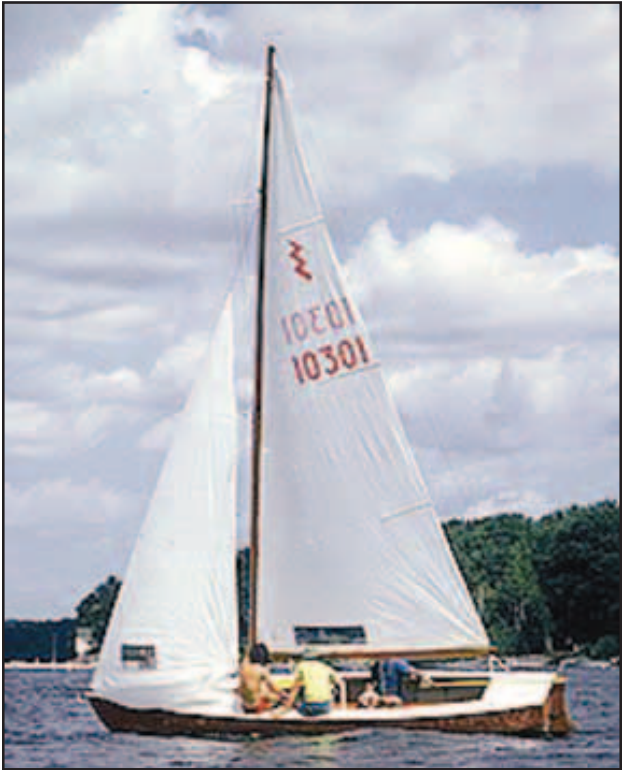
A 19-FOOT LIGHTNING DAYSAILER similar to the Purlisher’s first sailboat.

But as we got farther out into the Sound, the fog lifted slightly and much to my amazement, it revealed a 3-masted, square-rigged cutter right out of the history books. Through the fog, I couldn’t believe my eyes. I did not know that