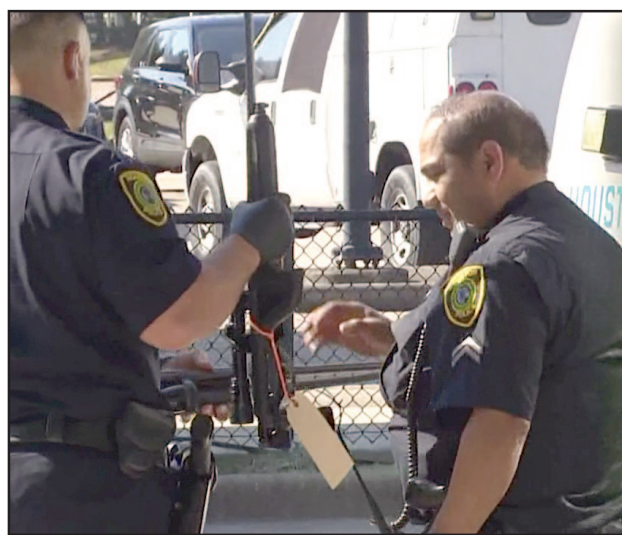
Houston Police Officers check an automatic rifle that was one of 333 turned in at the Second Buyback event held last Saturday at the METRO station in Westchase.