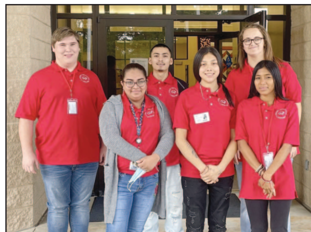
Student Project: Career Prep students at the Crosby High School picked the design for their T-shirts, printed the logo on vinyl and then heat-pressed the artwork onto their shirts.

This month has been a special chance to recognize custodians, teachers, and principals. October is National Principals Month. We have strong leaders and mentors on our campuses. Our principals love to see families out and about and hear stories about favorite teachers. It gives them a real sense of the connections our staff members are making. October 5th was World Teachers Day. So many of us have wonderful memories of teachers who made an impact. Whether the