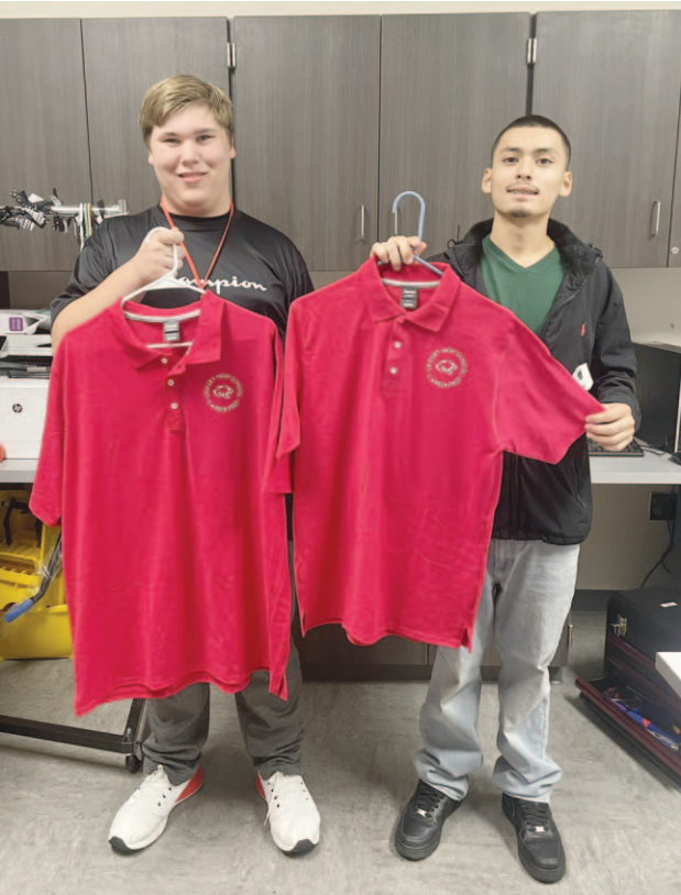
Career Prep students show their Tee-Shirt designs.

We are now just a few weeks away from a big celebration of literacy. We’re inviting 400 third graders from across the District to a special rally at Crosby High School. The NCAA Final Four crew will be in town to celebrate the start of the “Read to the Final Four Competition.” Our third graders will log each minute they spend reading in a bracket-style competition! The contest begins November 7th. If you have a third grader at home,