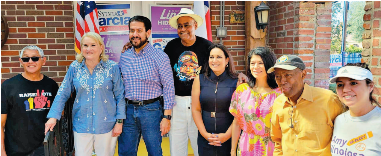
Harris County's elected officials at Congresswoman Sylvia Garcia's "get out the vote rally"