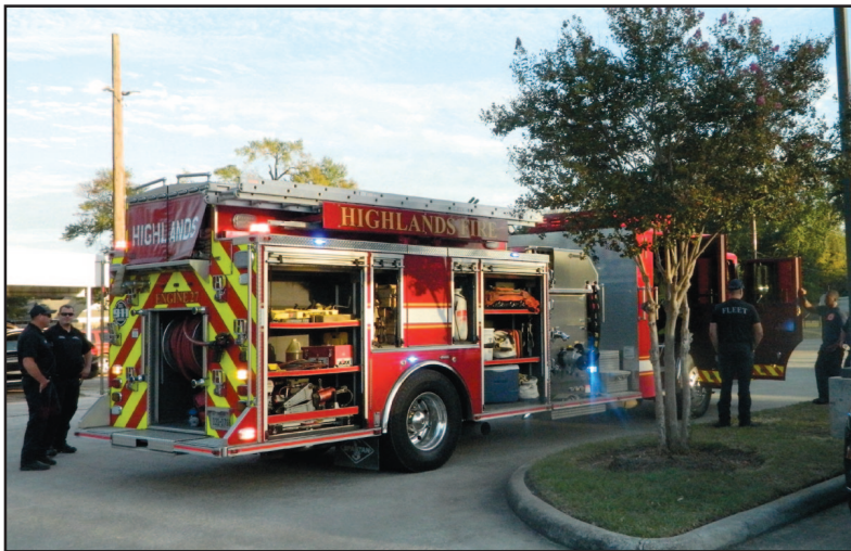
Highlands Volunteer Fire Department had one of their Fire Engines present, and kids and adults got to sit in the firemen's seats and see and explore the equipment they use for fires and rescues.