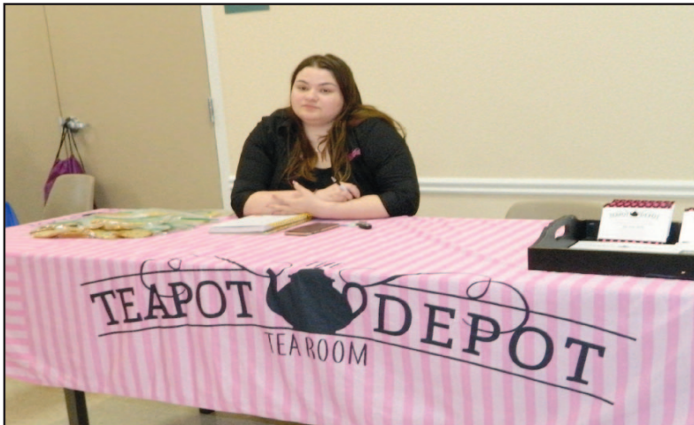
Teapot Depot has a reputation for delicious and special foods, as well as a homelike atmosphere in their restaurant in Highlands. At the National Night Out, they were serving a delicious Banana Bread that made you want to go back for more, or perhaps to the restaurant.