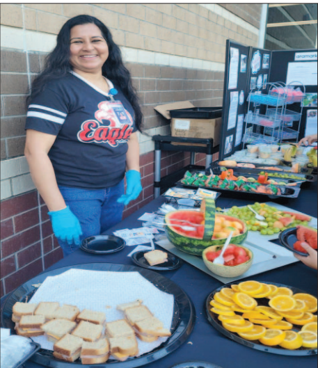
Aramark employee provides healthy snacks to the Alamo CATCH Night attendees.