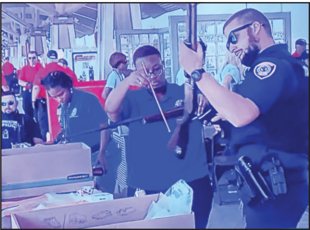
Officers inspect, catalog and disable guns that have been turned in during the Buyback program.