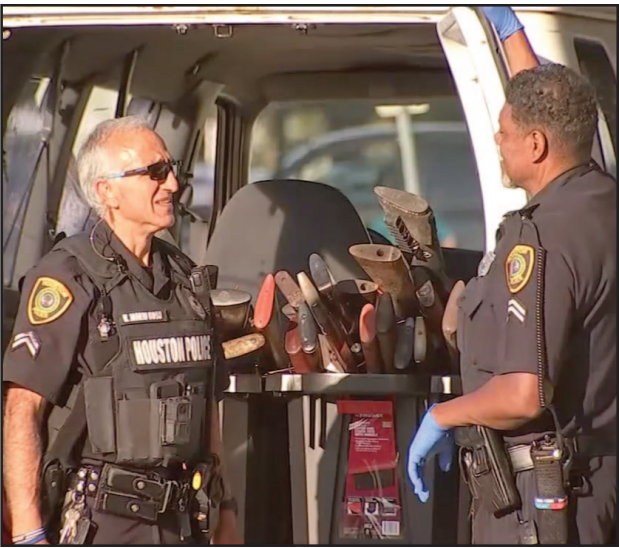
Officers load a van with rifles that have been turned in at the Gun Buyback program. Over 1200 firearms were collected in the event.

Back Issues are available at: www.starcouriernews.com