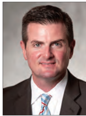
State Senator Brandon Creighton

Senate Bill 2 S.B. 2 provides $5.2 billion for Texas public schools. By increasing the basic allotment, providing across the board