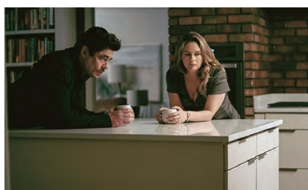
Benicio Del Toro and Alicia Silverstone star in "Reptile."