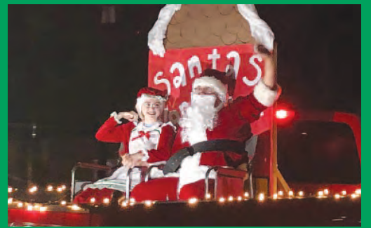
HOLIDAY SEASON! See Schedule of Festivals, Santa appearances, and Parades in Box at left and Crosby Superintendent's Message below: