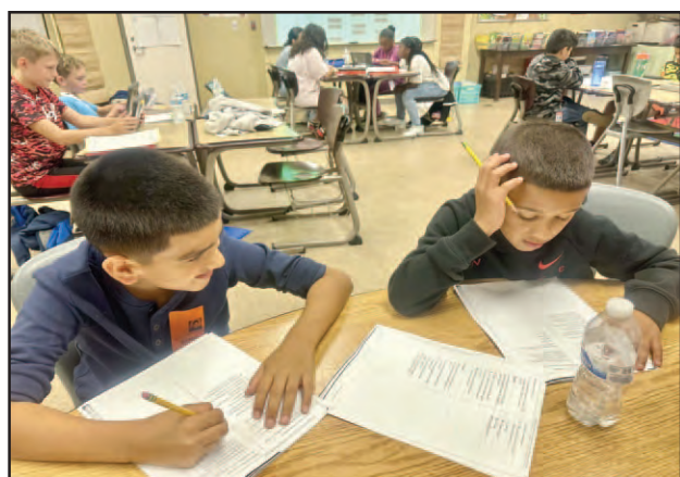
Elementary students work in small groups to analyze drama unit.