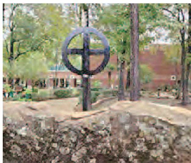
Lone Star College-Montgomery will unveil its Land Acknowledgment Monument Nov. 29 at noon in the Garden Area.

Lone Star College-Montgomery celebrates Native American Heritage Month with monument