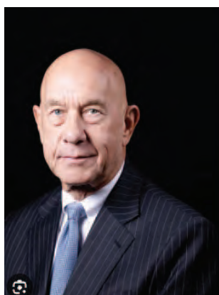
MAYORAL CANDIDATES JOHN WHITMIRE & SHEILA JACKSON LEE

The city of Houston has become accustomed to run-offs in their mayoral elec-