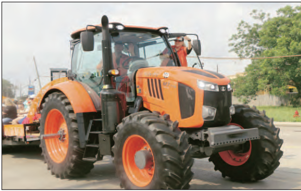
There were tractors of all sizes in the parade, a reminder that Crosby is still a farming community.