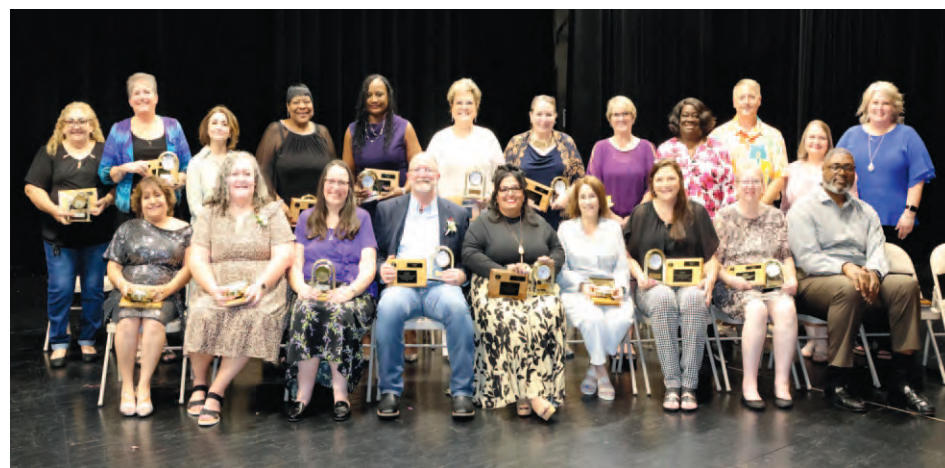
The 2023-2024 GCCISD Retirees contributed to more than 450 years of service in the district.

The evening was filled with gratitude and celebration, marking the end of the school year with recognition of the remarkable educators and staff members who have shaped the future of countless students. Goose Creek CISD's commitment to excellence in education is evident as they honor the achievements and service of their exceptional teachers and retirees and acknowledge the efforts and commitment of all staff to developing the whole child.