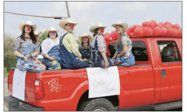
There's nothing more fun to liven up a rodeo moment or a parade than a truck full of clowns. Meet the Rodeo clowns!