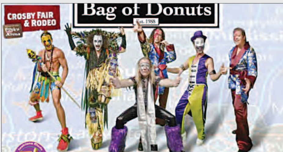
FRIDAY MAY 31 – BAG OF DONUTS 7:00 PM

With a flair for kabuki make-up and extravagant costumes, the four New Orleans natives and two brass men cover songs in a style they have branded as Superpop: Any song popular from any era. In the great tradition of stunning acts, BOD has to be experienced live to fully feel the impact.