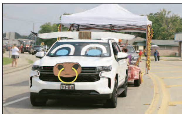
This truck was moooving right along with children in tow behind him. It was creatively decorated to look like a bull. Watch out!