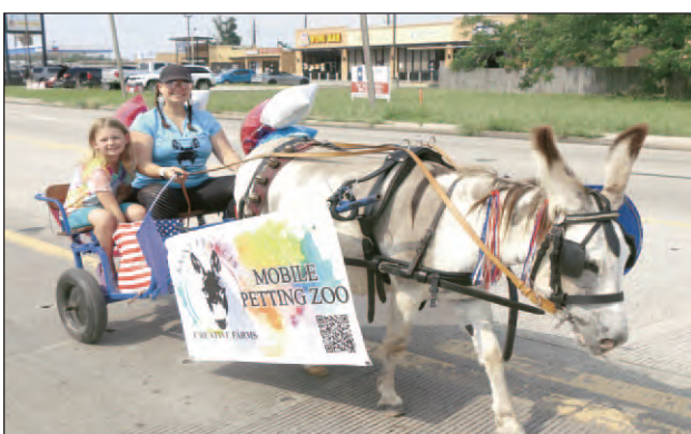
Miss Jewel the donkey was there representing the St. Francis Creative Farms Mobile Petting Zoo. The donkey is a regular in the parades to the delight of children and adults alike.