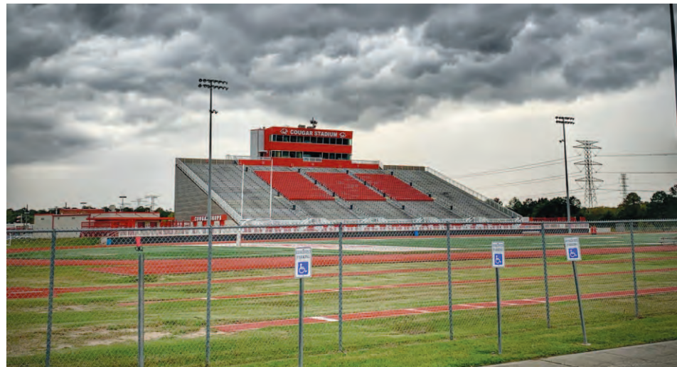
Cougar Stadium will undergo turf replacement this summer. The stadium was closed to the public starting June 3rd.

phone via email and/or text. Parents can download the app now through the iOS or Android app store. In the coming