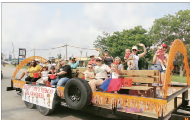
Check out these adorable Lil Cowpokes representing the Crosby Fair and Rodeo. Future cowboys and cowgirls from Crosby carrying on the country town legacy.

Continued. See CROSBY RODEO PARADE, Page 2