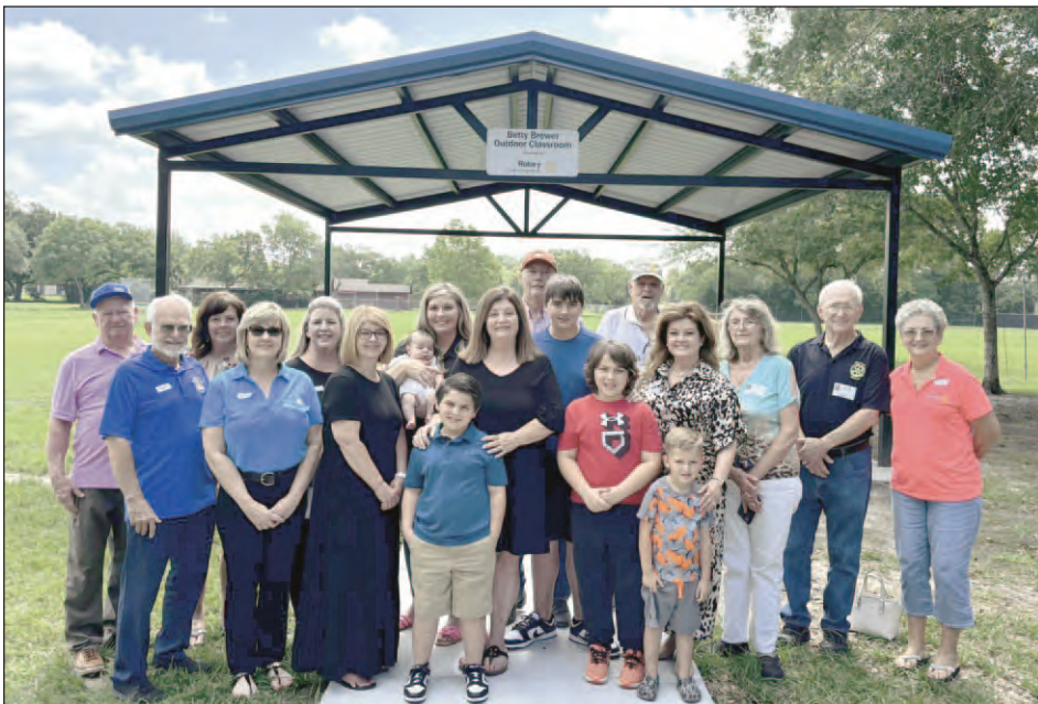
AT THE DEDICATION OF THE OUTDOOR CLASSROOM, ROTARIANS JOINED WITH BREWER FAMILY MEMBERS.

Continued. See ROTARY DONATES OUTDOOR CLASSROOM, Page 5