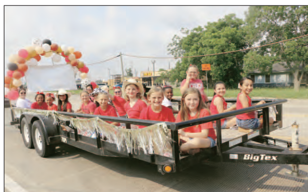
Those bright, smiling faces are members of the Crosby Elementary Starlettes decked out in their Cougar Red.