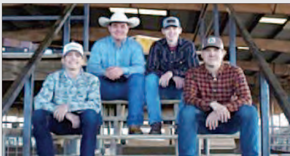
SATURDAY JUNE 1 – THE TWENTY TWOS 7:30 PM

With a flair for kabuki make-up and extravagant costumes, the four New Orleans natives and two brass men cover songs in a style they have branded as Superpop: Any song popular from any era. In the great tradition of stunning acts, BOD has to be experienced live to fully feel the impact.