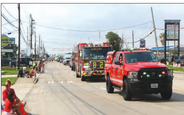
As is customary, every parade begins with some of Crosby's finest with the Crosby Volunteer Fire Department and EMS and the Precinct 3 Constable's office.