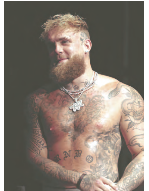
Professional boxer and YouTuber Jake Paul