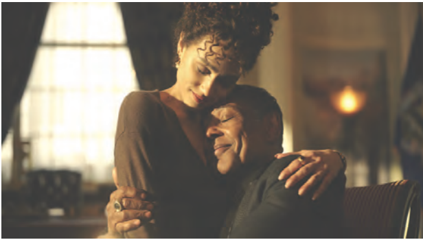
Nathalie Emmanuel and Giancarlo Esposito star in "Megalopolis."

of our dear Pogues won't be returning.