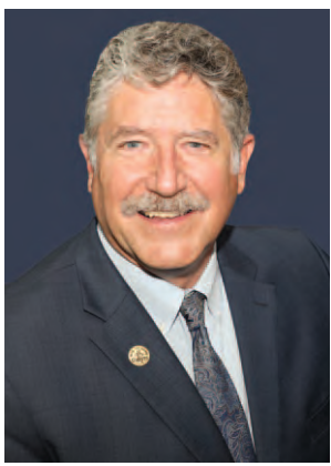
Goose Creek CISD Superintendent Randal O'Brien

Advocacy shapes our daily decisions and actions, whether supporting loved ones, promoting fairness at work, or driving change in our communities. In education, it's no different. The "funding crisis" in Texas public schools, including Goose Creek CISD, highlights the need for collective action and determination. Alarming, some legislators have proposed restricting our right to advocate, making unity more crucial than ever.