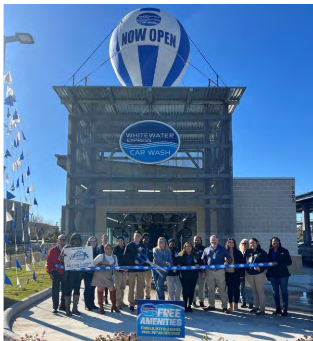
Baytown Chamber of Commerce Ambassadors and Whitewater Express Car Wash staff

You can find they're Baytown location at 7303 Garth Road. For more information, please visit their website at whitewatercw.com .