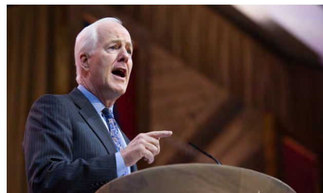
Senator John Cornyn, a Republican from Texas

Sen. Cornyn authored the Creating Helpful Incentives to Produce Semiconductors (CHIPS) for America Act , now law, to restore semiconductor manufacturing on American soil by increasing federal support to stimulate advanced chip manufacturing, enable cutting-edge research and development (R&D), secure the supply chain, create American jobs, and ensure long-term national security. The bill was included in the William M. (Mac) Thornberry National Defense Authorization Act (NDAA) for Fiscal Year 2021 and became