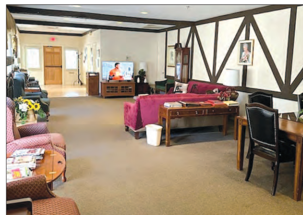
Mountbatten House was a Type A senior living home that hosted residents who were mobile and capable of maintaining their own hygiene.