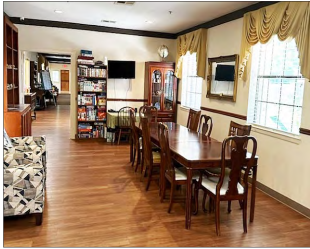
Residents loved the cozy, beautiful layout of Mountbatten House. The senior living home closed September 30, 2024 because of a lack of funds and rough waters over the last four years.

COVID not only affected the house residents and staff with strict restrictions, but also the amount of donations received since the DBE Chapters were unable to fundraise to the same degree they had previously.