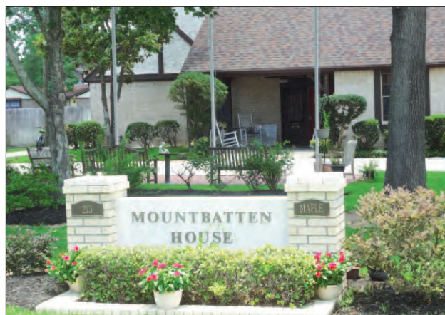
Mountbatten House senior living home has shuttered its doors and have listed the property and building for $1.3 million.

The historic Mountbatten House in Highlands has shuttered its doors permanently, another victim of the sour economy, COVID, and Mother Nature, according to the board.