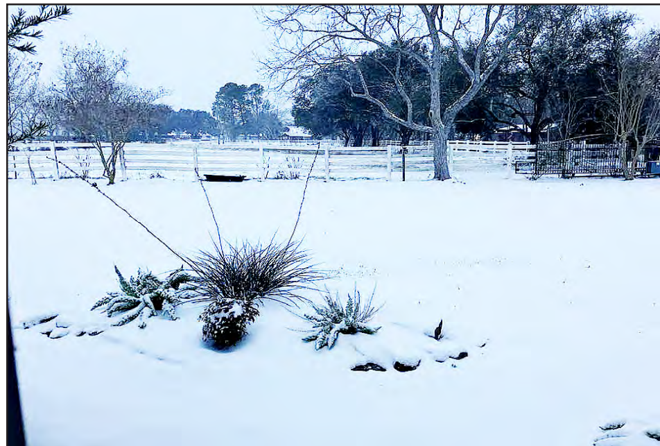
Don and Melinda Killion may have to have some new plantings after snow completely covered their landscaping during the snow.

area began to see the snow melt away as temperatures climbed back above 32-degrees and sunlight broke through to begin the melting process. The storm brought some anxiety for Houston and Texas residents who saw their power go out for several days when Winter Storm Uri impacted the coast with four to five days of winter ice and snow. According to Center-Point Energy, 99 percent of their customers main-