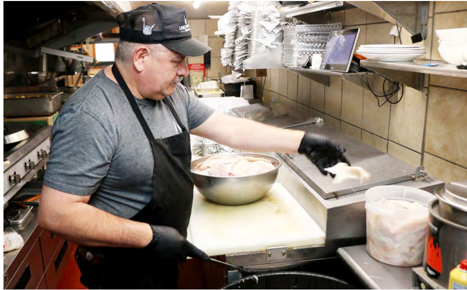
Chefs are known for their catfish delicacies prepared fresh daily at the restaurant.