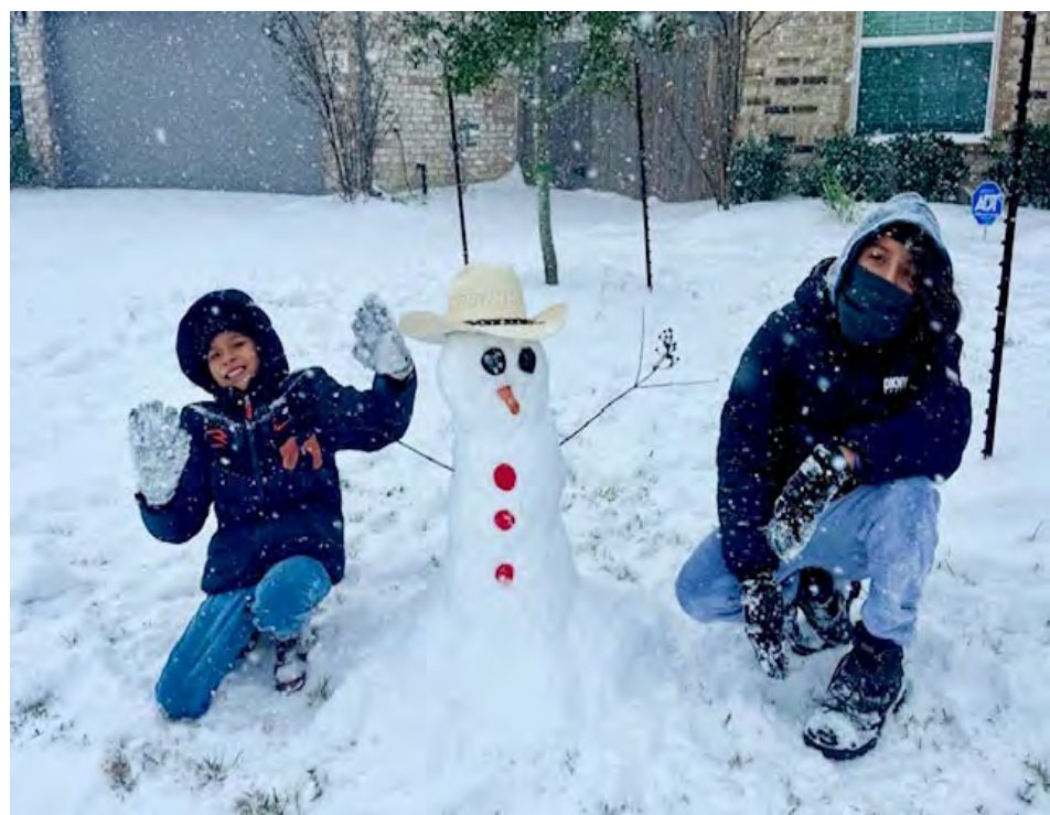
Crosby ISD students pose for a photograph with the snowman they created on January 21.