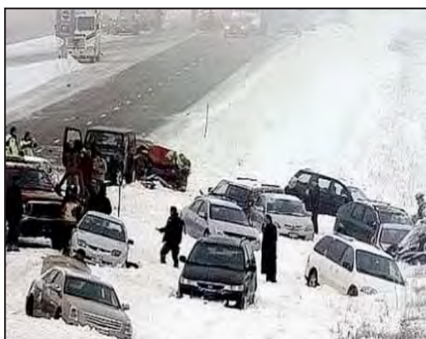
Residents Leave their houses the morning after the storm to enjoy and play with snow