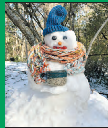
Terri Stanton built this snowman in North Shore and he's holding one of her own coffee cups. Stanton sells all kinds of pottery. See Front Page