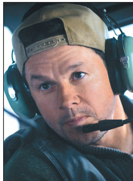
Mark Wahlberg star in Mel Gibson's "Flight Risk" (1973)

Wahlberg told People magazine that the best part about his temporary look was seeing his wife's face the first time he took off his hat. The movie, which was directed by Mel Gibson and also stars Michelle Dockery ("Downton Abbey"), was originally set for release in 2024 but got moved back to Jan. 25.