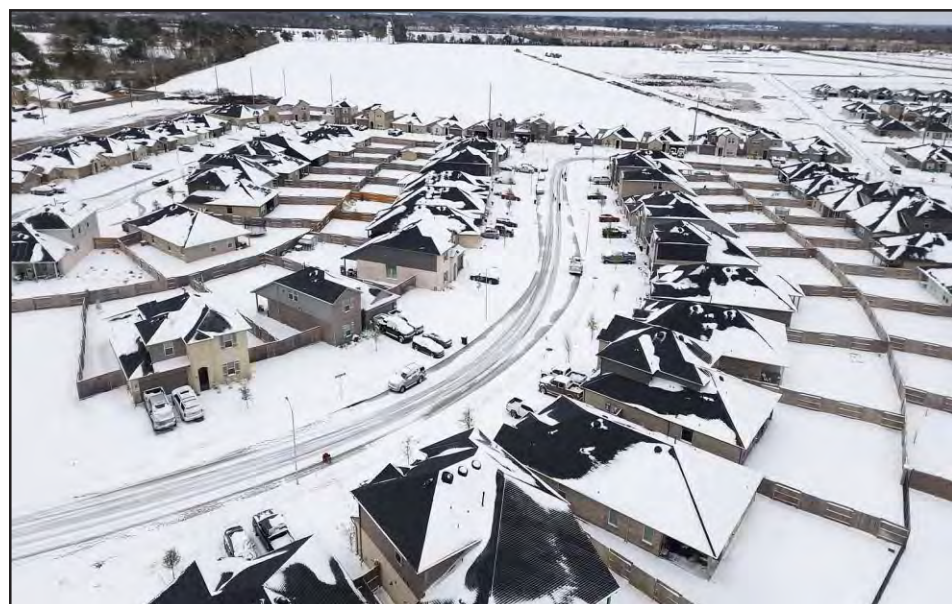
Jesus Villada neighborhood in Crosby is completely covered in snow including vehicles and side roads.