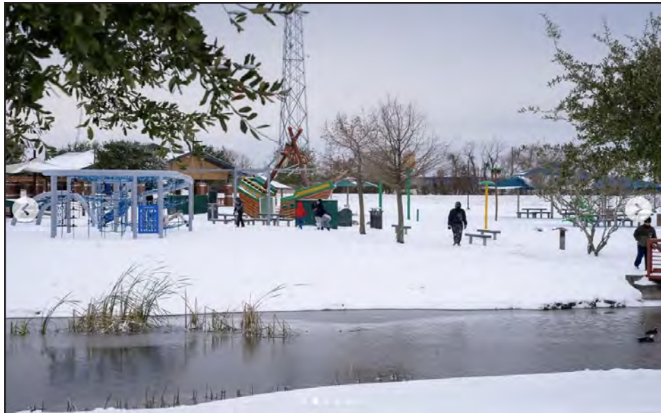
Mont Belvieu City Park completely covered with snow and kids having fun.

Mont Belvieu's citizens ability to remain safe and took of precautionary measures throughout the storm with zero traffic incidents serves as a testament to the power of preparation and community cooperation.