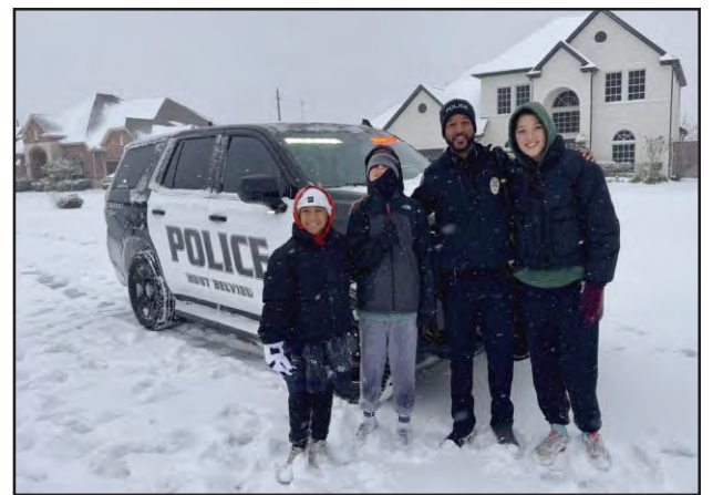
MB Police officer and kids from the neighborhood posing for a good memory