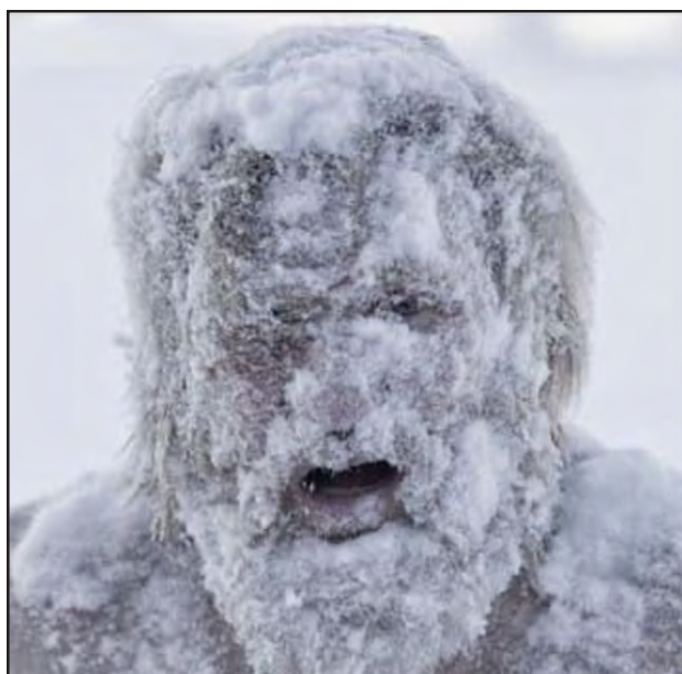
Pictured, Midnight Shift Sergeant coming in to brief the oncoming day shift