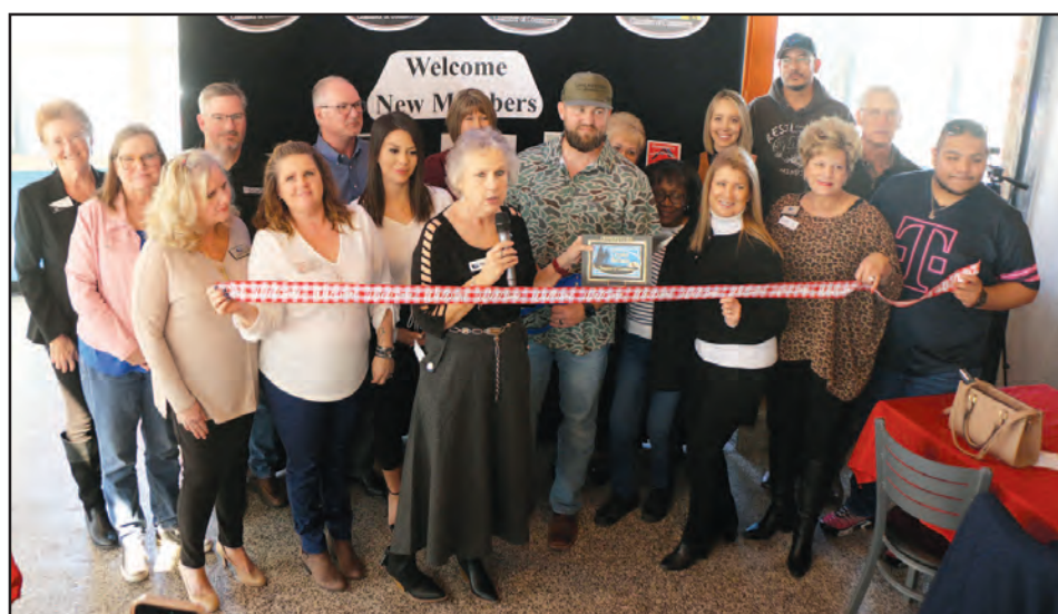
The Crosby-Huffman Chamber of Commerce celebrated the ribbon cutting with the Lake Houston Brewery in Huffman on Thursday. The members also had lunch at the restaurant and tasted the many delicacies.