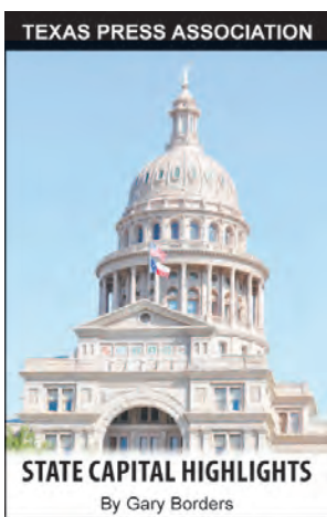
STATE CAPITAL HIGHLIGHTS By Gary Borders

The News reported that the official recommendation of a reservoir project in no way guarantees its construction. The permitting process at the