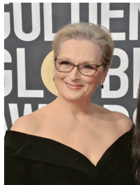
Actress Meryl Streep is dating on-screen love interest.

A: Yes, Donnie Wahlberg and Joey McIntyre have both made a successful transition into acting since their days of singing and dancing with New Kids on the Block, a wildly successful boy band from the '90s. Wahl-