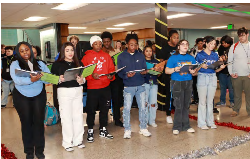
Sterling Choir students featured as one of the many student performances at the Black History Program.

gram was a heartfelt appearance by Charles Johnson, the Mayor of Baytown and a proud alumnus of Ross S. Sterling High School. Mayor Johnson delivered a mes-