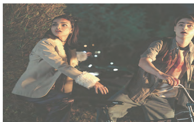
From left, Rachel Zegler and Jaeden Martell star in "Y2K."