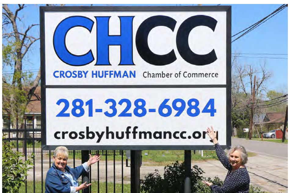
After months of consideration, the Crosby-Huffman Area Chamber of Commerce has changed their logo and this week their new sign with the new logo was installed at the office on First Street. All future correspondence and merch will reflect the new logo.