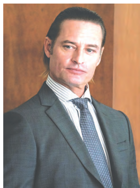
Josh Holloway as Roarke Morris in "Yellowstone"

He hasn't publicly attributed his weight loss to surgery or GLP-1 medications like Ozempic, but he does have a personal chef and a nutrition coach. The charismatic singer is currently serving as "American Idol's" first Artist in