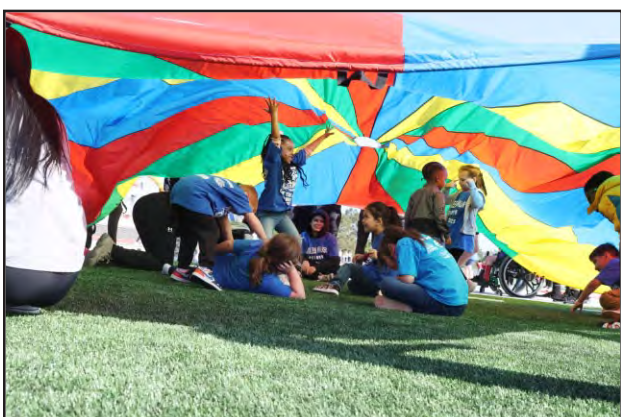
Students enjoyed playing with a parachute during the Coleen Walker Relays at Cougar Stadium. There were dozens of field activities for students to enjoy.