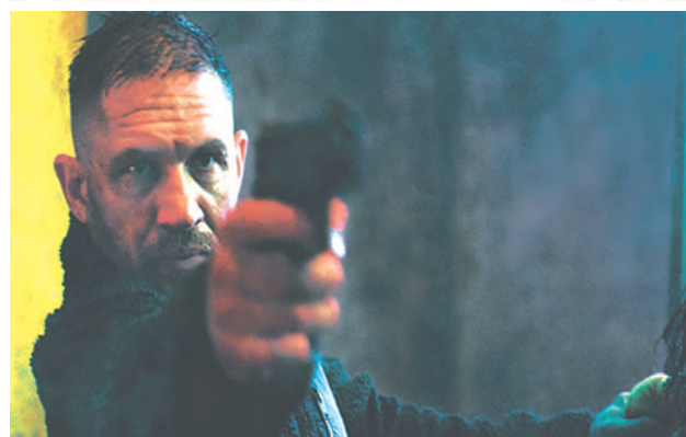
Tom Hardy stars in "Havoc."