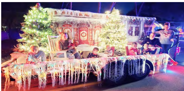
THIRD PLACE: Otis Heating & Air

Judges' comments: "This just looks like Christmas like a long time ago!" "I love there is a full family, with grandparents, children, and grandchildren." "This definitely