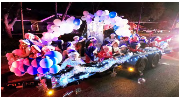
HONORABLE MENTION: Newport Elementary

looked like a Hallmark Christmas card." "It reminded me of those days when the whole family sat in the room together to celebrate and share their