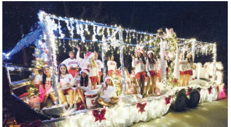
FIRST PLACE: Crosby Middle School Cheerleaders

Continued. See LIGHTS, FLOATS SHINE BRIGHT AT 27TH, Page 5