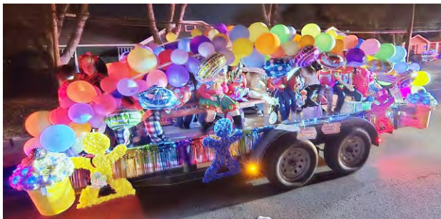
HONORABLE MENTION: Crosby Youth Football