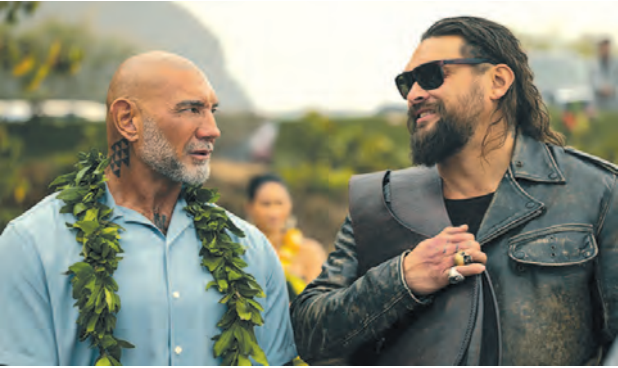
Dave Bautista, Left, and Jason Momoa star in 'The Wrecking Crew.'